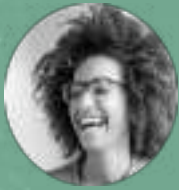
HARRIËT MBONJANI EYE FILM MUSEUM