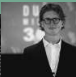
LUCIAAN GROENIER FILM FOR OUR FUTURE